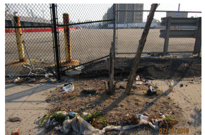
Treewell on Pioneer Street

The Puny Port Cultural Group started a street cleanup effort and found some resistance from locals. "Don't the Big Guys have money to do this?! Why should my garden center donate plants for treewells near the port? Sales are down thanks to this recession and heat," snarled one sweaty business owner during the hottest July on record.