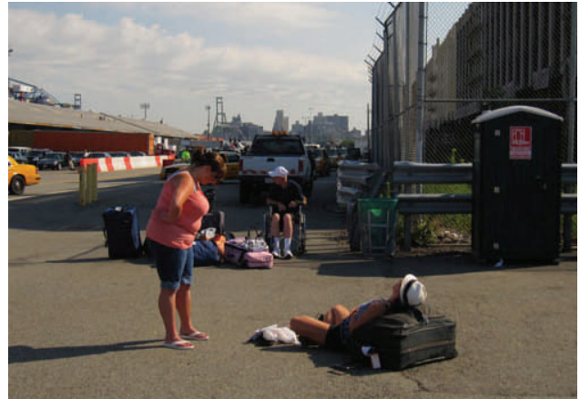
A family, with dad in wheelchair, schlepped out of the terminal to wait rather than endure the crush of the terminal pick up area. PPCG hopes to offer passenger amenities.

The results of that RFP will go into the hopper; and a second, follow-up RFP reflecting ideas from the first RFP (and elsewhere) will come out the year after that.