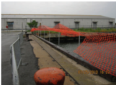
• Snow fence after a windy rainstorm

he is looking forward to submitting the bill for the fence to the Entity.